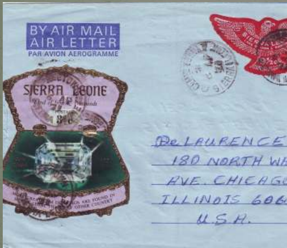
Sierra Leone, Apr 1971

Sierra Leone 21, Kassy Road Freetown Sierra Leone Dear Sir, I am asking you APR 12 1971 if you don't receive any Registered letter. I send a letter to you with it now I can't see the any Reply from you, so I want to know whether you have sent the order to me or you don't see the letter, the let me explain the thing that I order you, I send £3.55 for the complete letter writing book. ② I don't see any Reply from you, when are all the word that I want to ask. Thanks to you Sir, your Best friend Sierra Leone 21, Kassy Road Freetown.