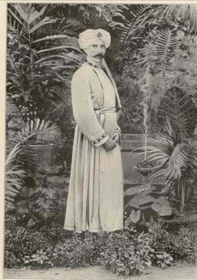
Artist's Conception of de Laurence Wearing a Turban and a Tunic