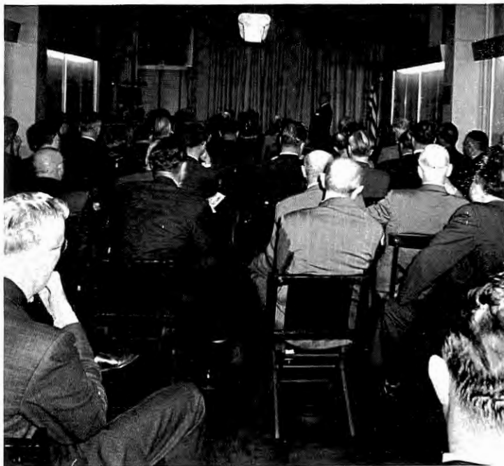
A meeting of The Collectors Club