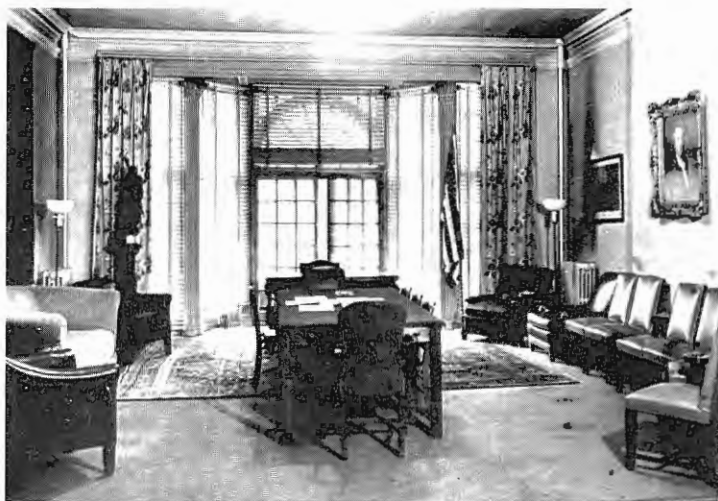
Members' Lounge on the second floor at 22 East 35th Street. The sculpture of an Indian which was the grand award in the Centenary International Philatelic Exhibition in 1947 may be seen at the left.