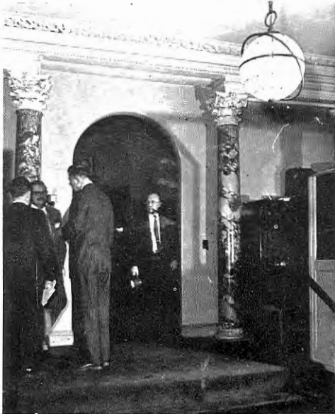
Entrance to the Stephen G. Rich Memorial meeting room at 22 East 35th Street.