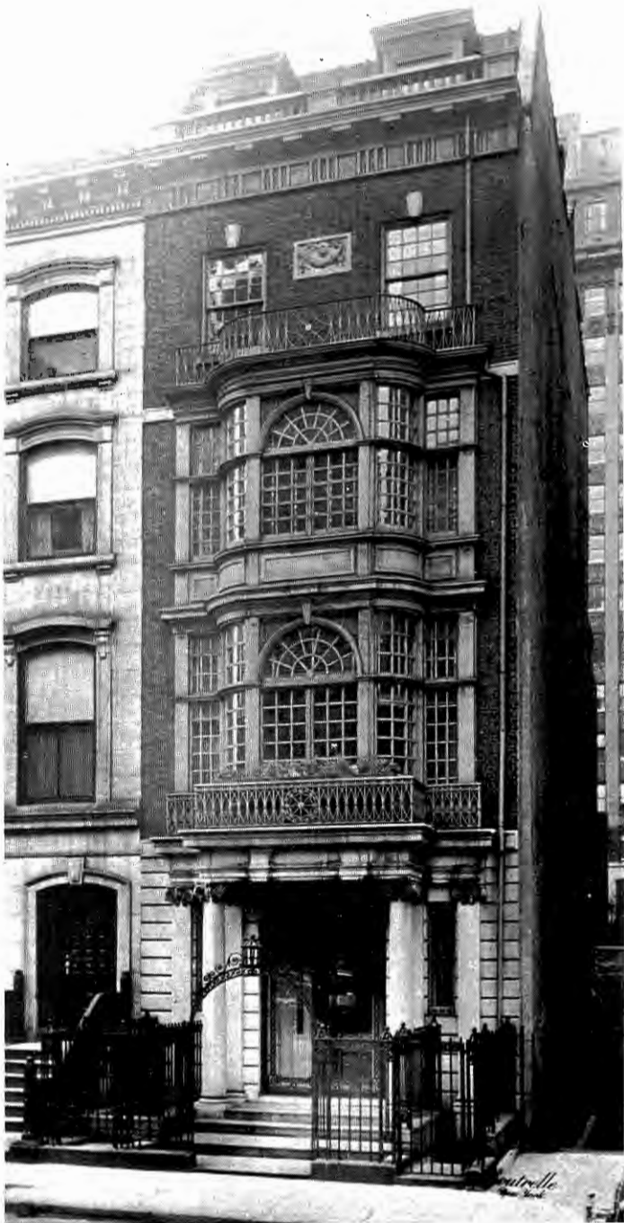
22 East 35th St. — Home of The Collectors Club Since Oct. 6, 1937