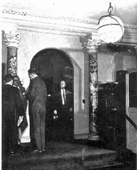
Entrance to the Stephen G. Rich Memorial meeting room at 22 East 35th Street.