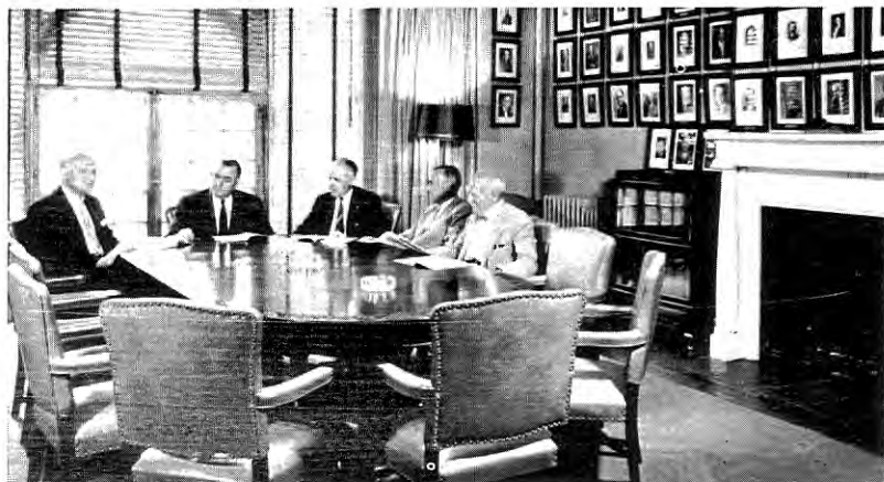
A session of the Board of Governors in the room provided for their meetings. Portraits of the club's past presidents are displayed on the wall at the right.