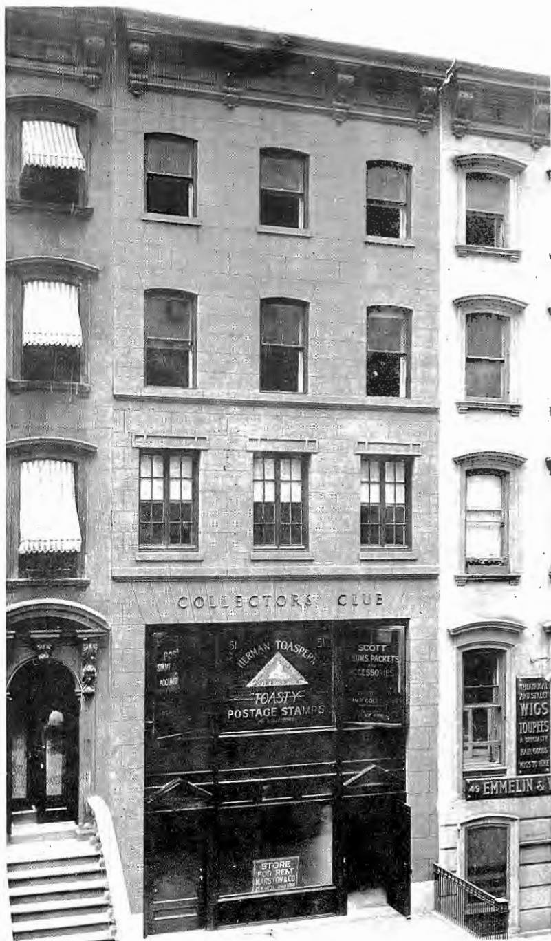
51 West 48th St. — Home of The Collectors Club From 1925 to 1931